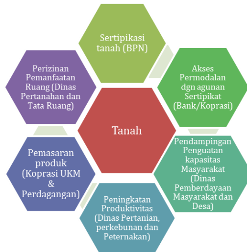
Figure 1. Scheme for Strengthening Access to Agrarian Villages in Purworejo

cultivation of Etawa goats. In addition, the ownership of the location in this village is also based on the social conditions of the community where most of the people have ownership more open mind. condition pereThe economy of the community, some of which are still not prosperous, also underlies the implementation of strengthening access to reform carried out in this village. The scheme for strengthening the access carried out can be described in Figure 1 below.