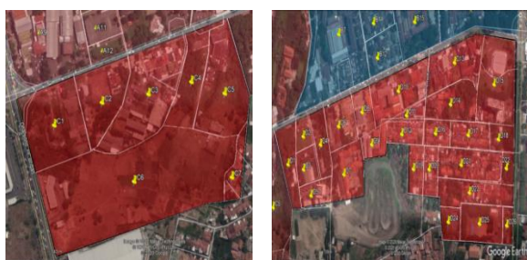
Figure 4.1 Zoning